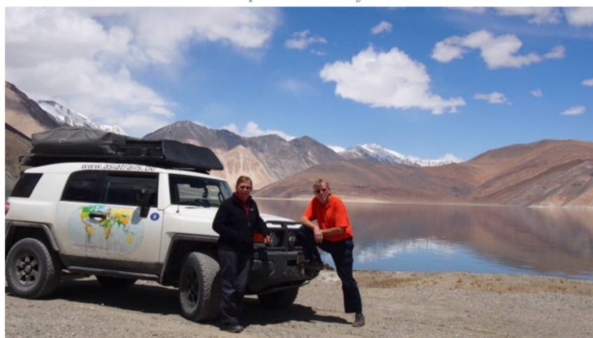
The couple at Pangong Lake, Ladakh

Find out more about this adorable couple here .