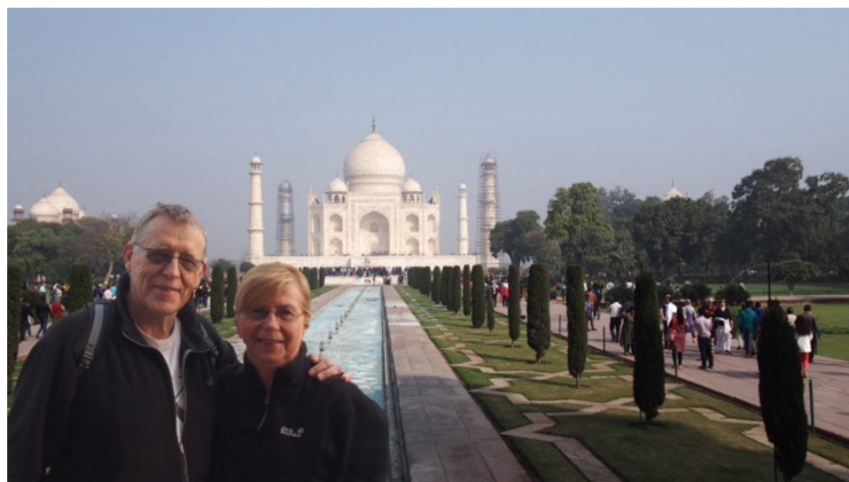
The couple at the Taj Mahal

and a State as Nagaland or West Bengal is so different from Sikkim or Kashmir Ladakh or Rajasthan. We love mountains and Kerala have some, maybe that is one reason why we like it. But travelling is not only seeing places or heritage buildings it's also being able to chat with people and learn more about them.